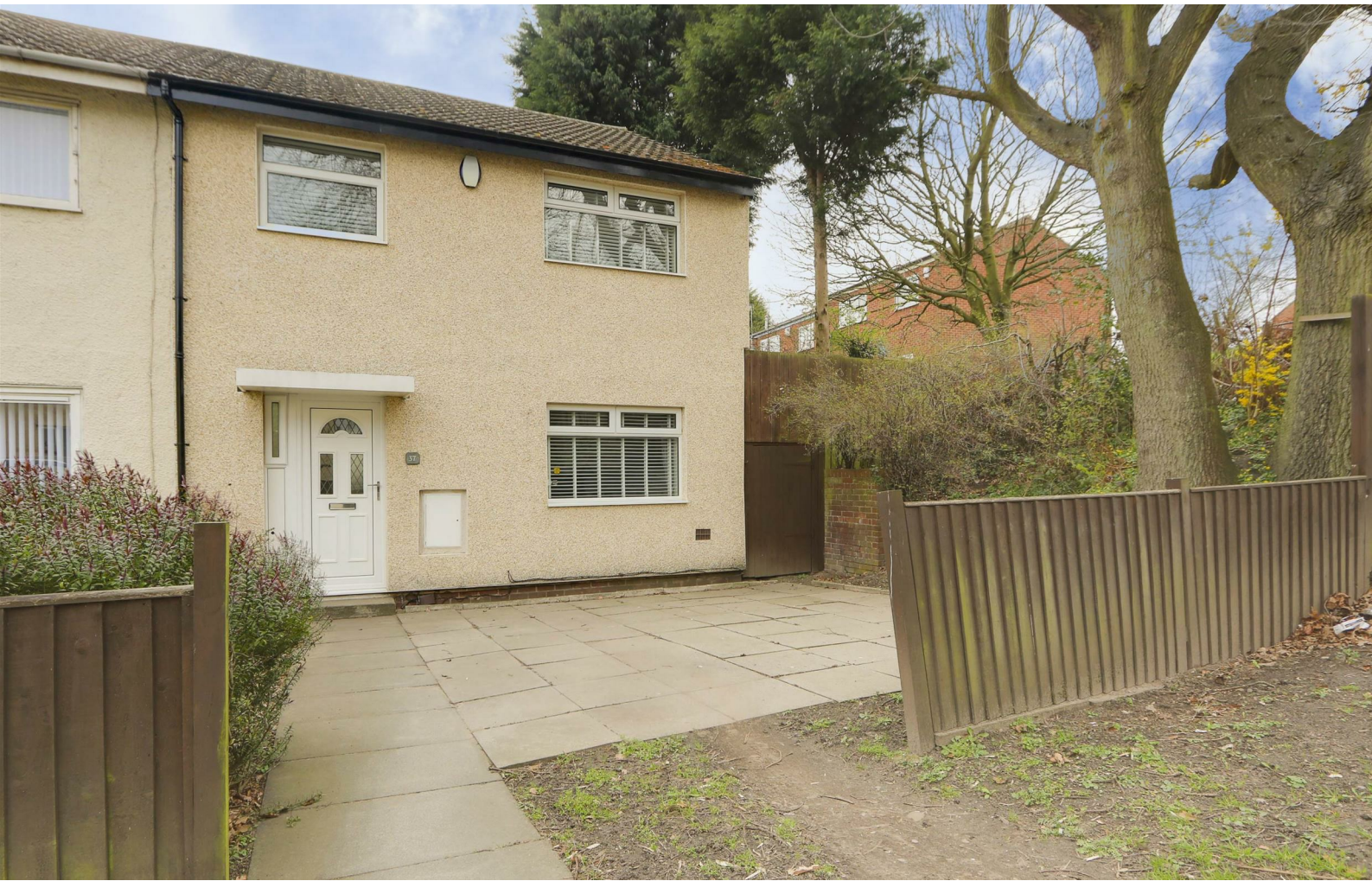
Lytham Gardens, Top Valley, Nottinghamshire NG5 9JA